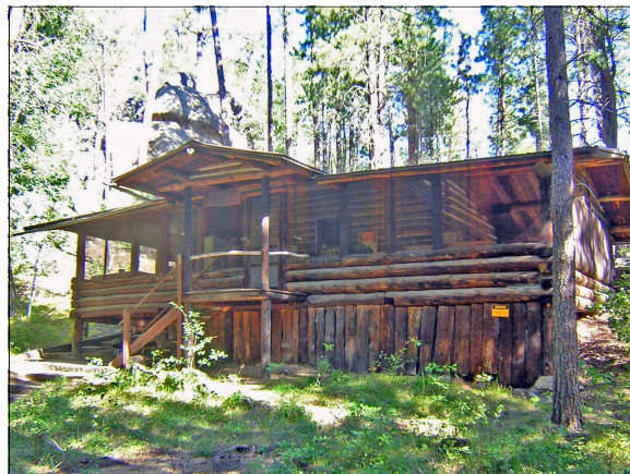
The Bishop's Cabin at Camp Remington

Provided: beds, mattresses, pots, pans, plates, cups, silverware, propane stove and refrigerator, fire-place. Water can be carried from nearby covered spring.