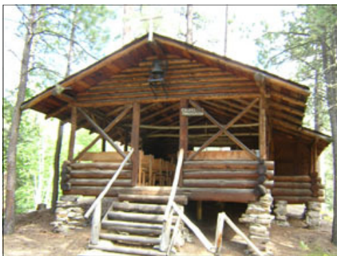
Chapel of the Transfiguration

FOR INFORMATION - Call Tony Gonsor at 605-673-2205