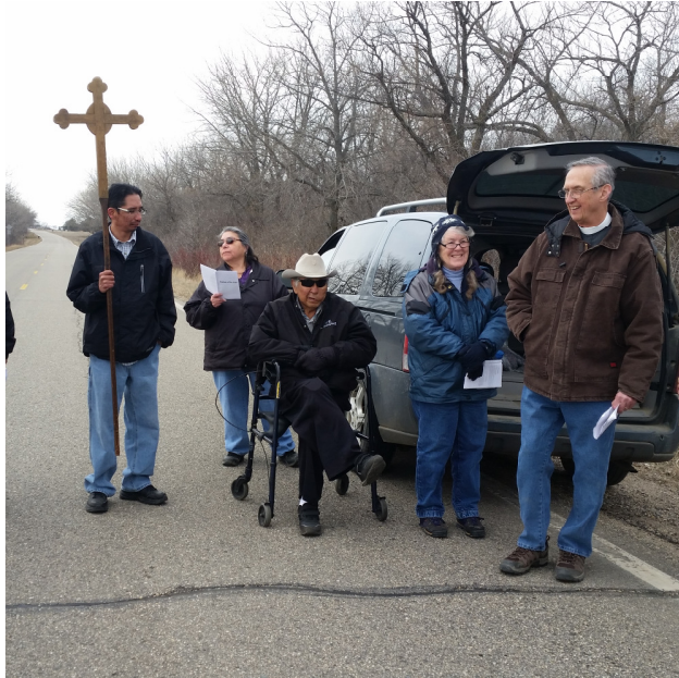
Around the Diocese Good Friday Walk 2016 The walk took place at St. James Mission, Enemy Swim

"On each Good Friday for over 40 years the members of St. James Episcopal Mission have participated in a 3 mile Good Friday Walk.