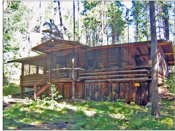
The Bishop's Cabin at Camp Remington

Bring your own: bedding or sleeping bags, blankets, towels, food and beverages, and lighting - fluorescent lanterns, propane lamps, Coleman lanterns with fuel, etc.