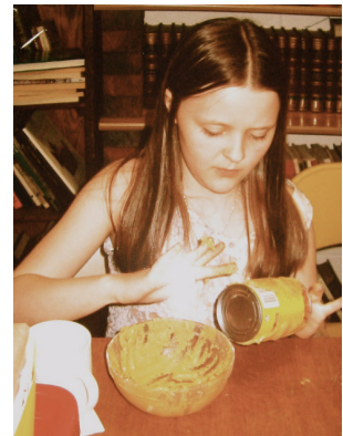
Creating a "mud hut"

S unday School children at Church of the Holy Apostles have learned what an Episcopal church is like in a remote village in South Sudan by making a replica of it.