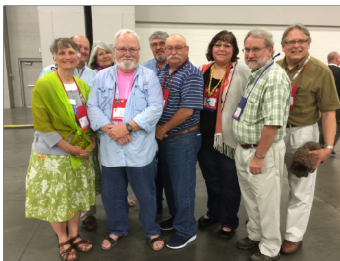
The South Dakota Deputation (L-R):

In our baptism liturgy we proclaim “one Lord, one Faith and one Baptism.” Our Lord is Jesus, our faith is in Jesus, and we are baptized as Jesus commanded in the name of the Father, the Son and the Holy Spirit. To maintain our unity in the midst of our diversity in the Diocese of South Dakota, both congregation and clergy retain the prerogative to not allow or officiate at same-sex marriages. Both congregation and clergy also have the prerogative to allow or officiate at same-sex marriages. This discernment should take place in the midst of prayer and teaching. The bishop will address this issue further at the clergy conference to take place just before Diocesan Convention.