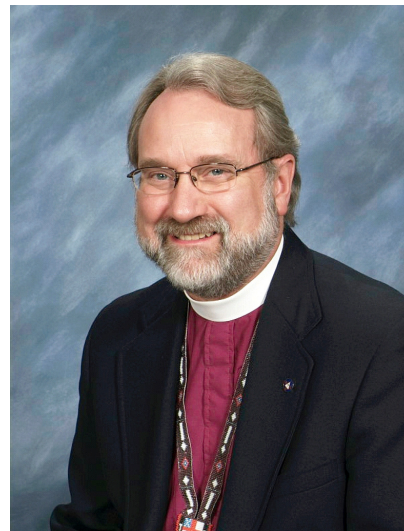
The Rt. Rev. John Tarrant

On the Tuesday following Convocation I was off to Salt Lake City for the Episcopal Church's 78 th General Convention. Niobrara Convocation and General Convention are opposite types of church events. You can attend Convocation for the cost of gas, if you camp. General Convention is designed for the economically privileged (our Diocese pays most of the expenses for our deputies or it would be unaffordable). Convocation is highly relational with a little bit of church business thrown in; General